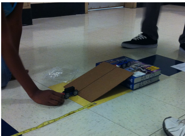
Figure 1. Accident Challenge

The mayor...has challenged local engineering companies, including yours, to develop a solution...to determine whether Vehicle A was speeding during these collisions. The police investigate the accidents immediately after they occur, and the chief of police has stated that they must have evidence from the crash site to confirm the driver was speeding. Your company thinks it can provide a solution.